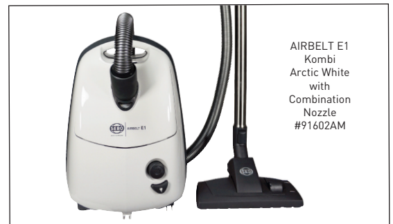
AIRBELT E1 Kombi Arctic White with Combination Nozzle #91602AM