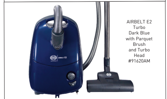
AIRBELT E2 Turbo Dark Blue with Parquet Brush and Turbo Head #91620AM