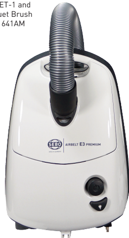
AIRBELT E3 Premium Arctic White with ET-1 and Parquet Brush #91641AM