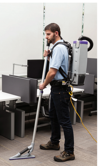
*The filtration value of ProTeam's ProLevel Filtration System in this vacuum is achieved by the use of a multi-stage filtration system, including intercept micro filter, micro cloth filter, plastic cage with foam filter, and post-motor filter made from HEPA media, as tested per ASTM 3150.